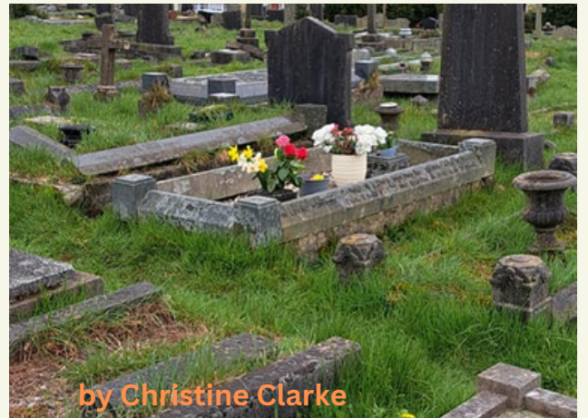
by Christine Clarke

Since this wonderful day the grounds were left uncut until recently. Even with the grass cut you still need to be careful. However, no doubt it will not be long before it is overgrown again. If tending to a grave, please help and try and cut the grass surrounding your plot.